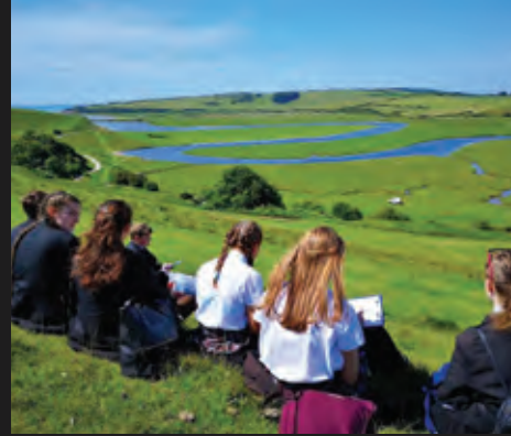
River Cuckmere Geography Trip